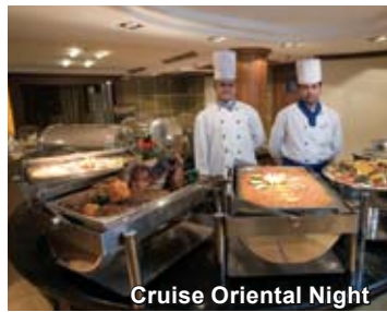
Cruise Oriental Night