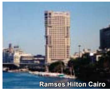
Ramses Hilton Cairo