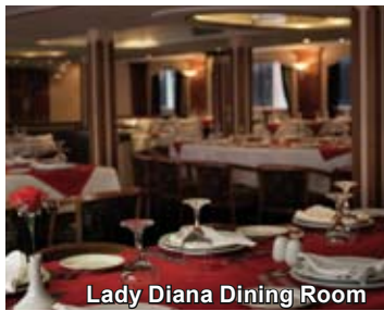
Lady Diana Dining Room