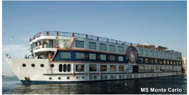
MS Monte Carlo

Deluxe Class (5*) Cairo hotels are tastefully furnished and having a full range of amenities and high level of service. The M.S. Monte Carlo Elegantly designed for maximum comfort has 71 Junior Suites and 2 Presidential Suites all outside cabins with private bathroom with shower and hair dryer, TV and safe deposit box. Facilities on board include Piano Bar, Boutique, and Beauty shop and Laundry service. A Swimming pool and Jacuzzi are located on the Sundeck. Nightly entertainment including Belly dancing Show and Galabea party.