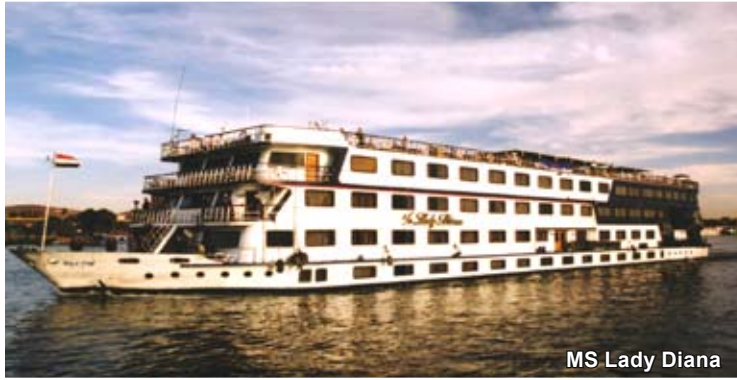
MS Lady Diana

First class (4/5*) Cairo hotels are basic, clean and comfortable with private bathrooms usually located in a quiet area of Giza with a nice garden setting. The M.S. Lady Diana has 67 outside Junior Suites and 4 Royal Suites with all the features, character and cuisine of the higher class cruise. Nightly entertainment includes a Belly dancer show and Gallabiya party. Facilities on board include a gift shop, hairdresser and laundry service and safe deposit boxes available at reception. A Swimming pool and Jacuzzi are located on the Sundeck.