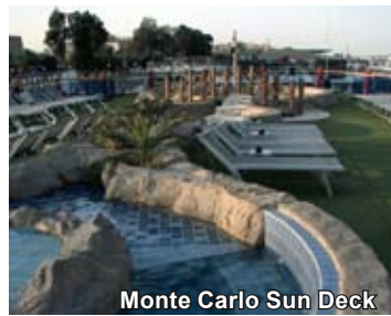
Monte Carlo Sun Deck