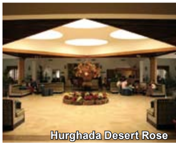
Hurghada Desert Rose