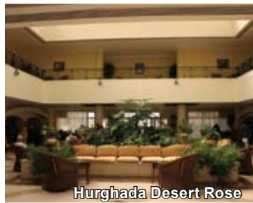
Hurghada Desert Rose